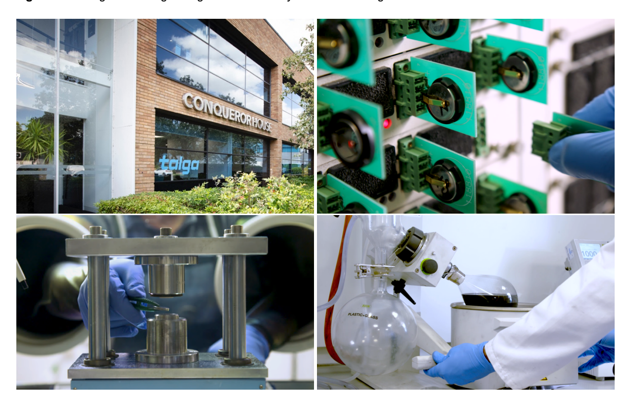
Figure 4 Making and testing next-generation battery materials at Talga's new Centre of Excellence.

This development work aims to diversify Talga's product portfolio into emerging energy storage materials and future scope technologies. In addition, the centre is home to Talga's material recycling and repurposing R&D operations.