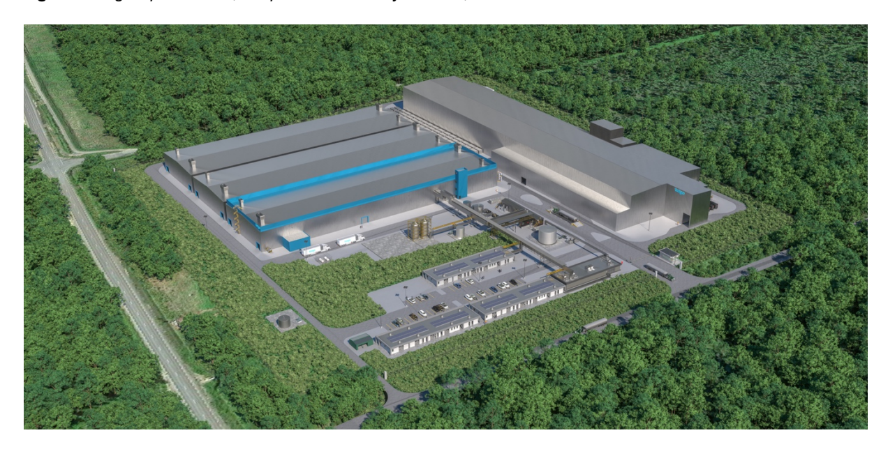
Figure 1 Talga's planned 19,500tpa anode refinery in Luleå, Sweden.

Following receipt and review of public statements, along with deliberation, the Court is expected to rule on Talga's request for permission for early construction. The ruling would allow Talga to commence construction of its battery anode plant immediately upon receipt of the relevant building license. A separate building licence application is progressing with local authorities in Luleå Municipality to potentially commence construction as early as 2H 2023.