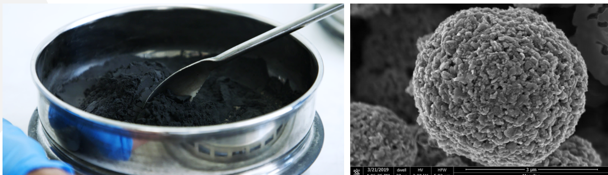
Figure 1 Talnnode®-Si under development at Talga’s R&D facilities in the UK. (L) Active anode powder preparation and (R) Scanning electron microscopy image of Talnnode®-Si particle during production.

In parallel, the Company is conducting feasibility work towards accelerating commercial Talnnode®-Si production options. Negotiations with leading global EV manufacturers regarding supply volumes has commenced and production site location selection in Europe is well underway.