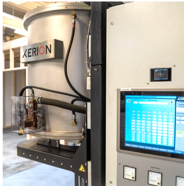
Figure 2 Part of Talnode®-Si pilot plant operating at Talga's Rudolstadt, Germany, facility.