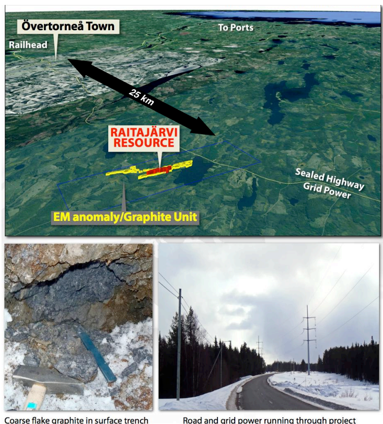
Coarse flake graphite in surface trench