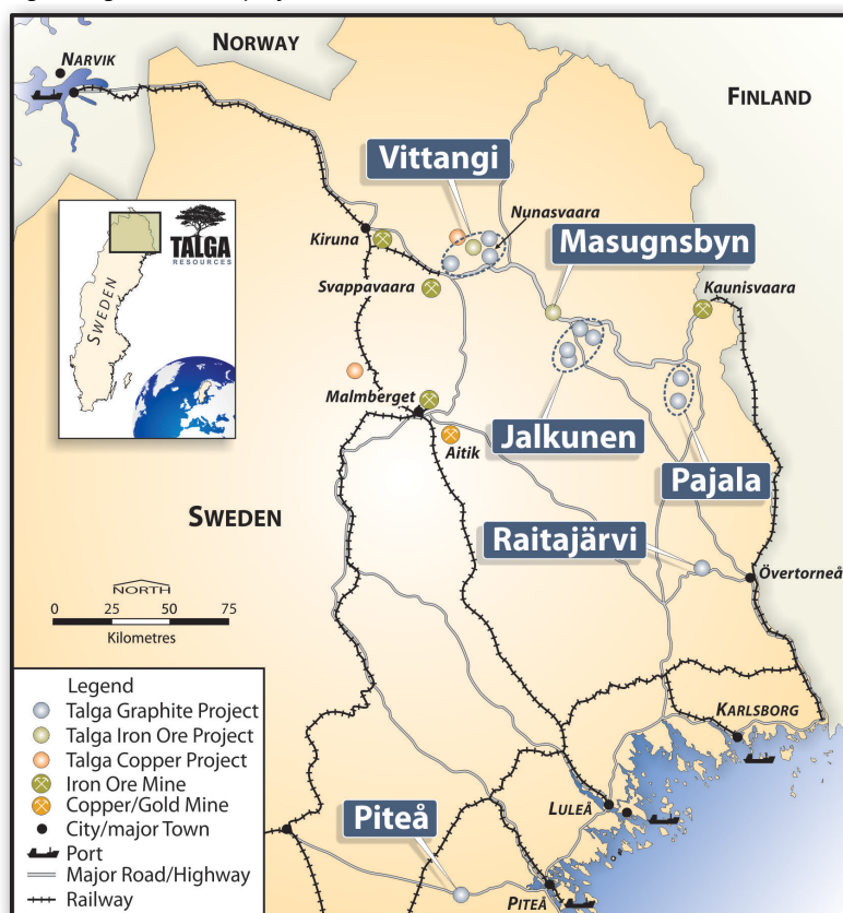
Fig 1. Talga Resources project locations in north Sweden.