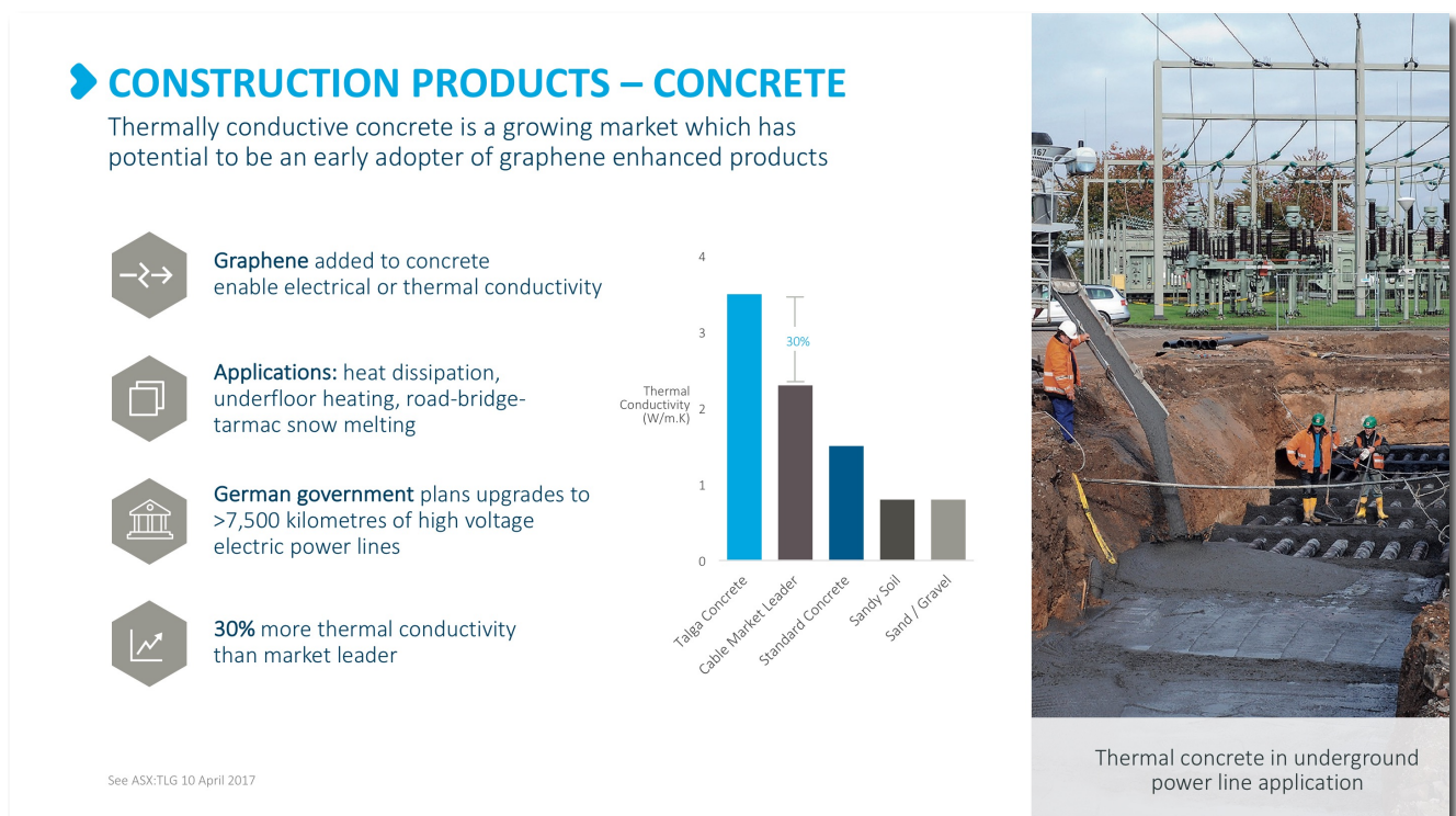
Figure 2. Talga graphene and graphite products increase thermal conductivity of concrete to enable power cables to be buried underground and improve heat dispersion, power efficiency and costs.

The results were highly encouraging for an initial concrete test work campaign and optimisation alternatives will be investigated with industry partners to further improve performance.