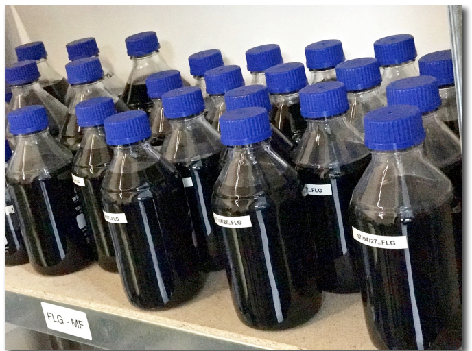
Figure 1. Aqueous dispersions of few layer graphene made at Talga facility in Germany for coating products.

As per the terms of the joint development agreement ("JDA") with Chemetall, all samples used in testing are being purchased at agreed prices and graphene loadings. The first trial campaign required only a modest quantity of Talga sample graphene enhanced products, however, it is expected that the quantum of future samples will increase as the testing program expands. Talga invoiced Chemetall during June for the first samples provided under the JDA.