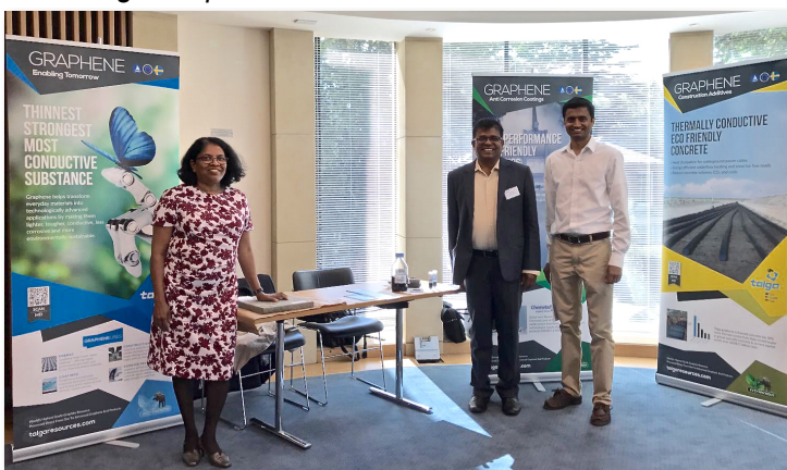
Talga Technologies Limited (UK) staff presenting at Cambridge Graphene Centre.

Cambridge is a major hub for graphene technology and global leading aerospace, electronic, biotech and material technology companies. Local opportunities are also increasing for major state funded initiatives in the electric vehicle sector, as the UK government has announced intent to ban petrol and diesel vehicles by 2040 following similar plans announced in France, Norway, Sweden and Germany (Bloomberg New Energy Finance and public data).