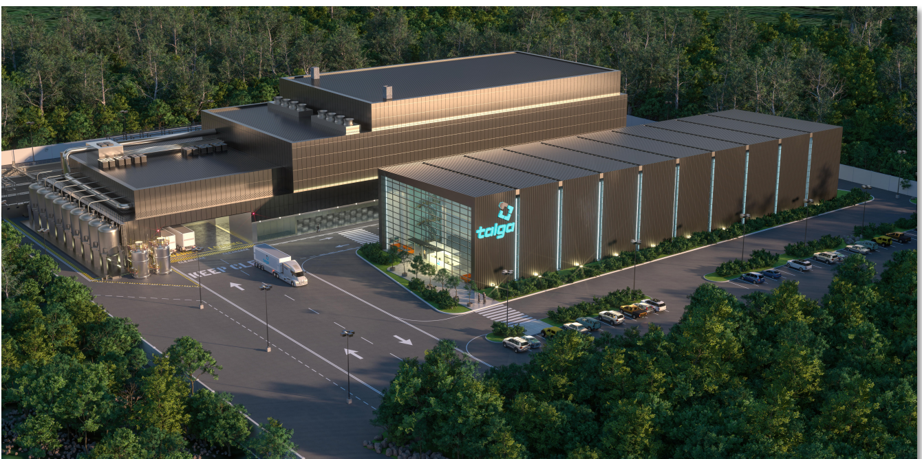
Figure 1. Visualisation of Talga's planned 19,000 tonnes per annum battery anode refinery.

Talga will look to further refine these outcomes in the upcoming commercial Detailed Feasibility Study ("DFS") planned for completion in Q1 2021.