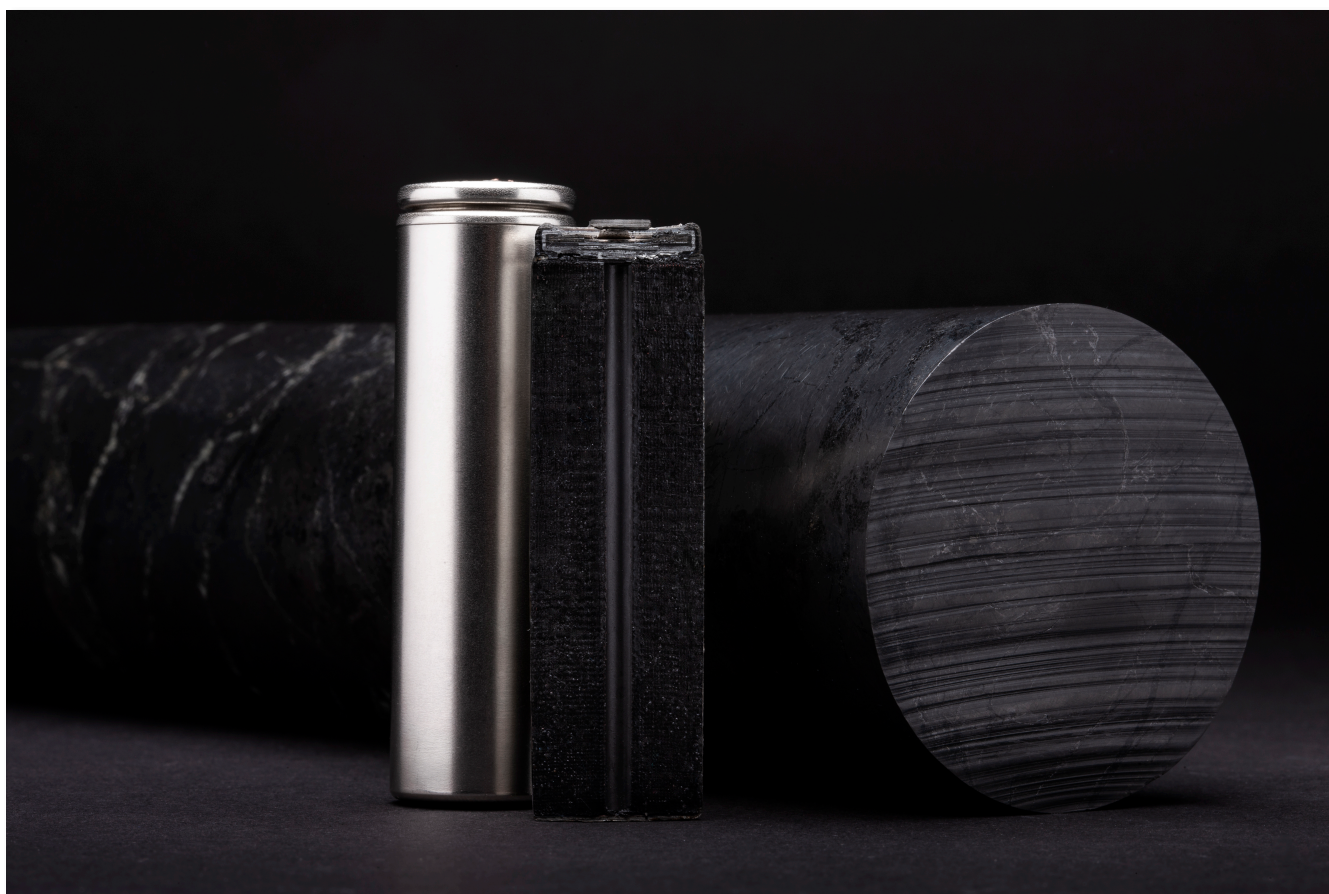
Figure 6. Vittangi graphite drillcore with size 2170 (L) and 18650 (R) Li-ion batteries (cut to expose the anode).

This continued growth in graphite resources positions Talga for an increasingly significant role in battery anode production for the booming electric vehicle markets. As an approximate guide there is ~1 million tonnes of graphite anode per 20 million electric vehicles, and the European Commission has classified graphite a Critical Raw Material necessary for the transition to a more sustainable society.