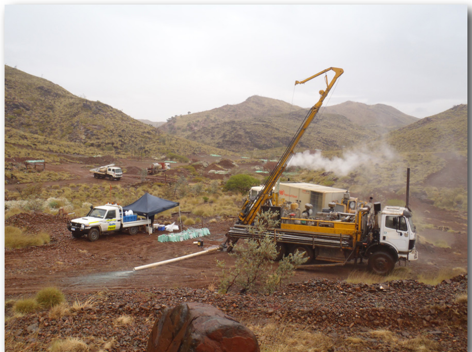
Fig 1. Step out 35-hole RC drilling program underway at the McPhees prospect, Talga Talga gold project.

The Company successfully raised $2.1 million by placing approximately 6 million ordinary shares at $0.35 per share, preparing the Company to expand the pace and scope of its gold exploration.