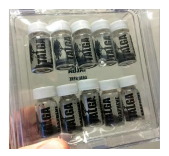
Q: In July 2015 Talga signed an agreement with Haydale to supply graphene materials. Is that still in place?

Talga can produce a range of graphene particle morphologies from vFLG to GNP's to suit the applications, but specifically works in direct production of pristine graphene, not GO, to retain conductivity potential and other properties. To this end we have developed in-house exfoliation, functionalization and dispersion technologies to suit our target additive applications, and leave the oxide routes to others for now. We strive for economic advantages through integrating our carbon source through processing into a product, so at this stage do not pursue CVD or other methods that would not use our 100% owned carbon sources.