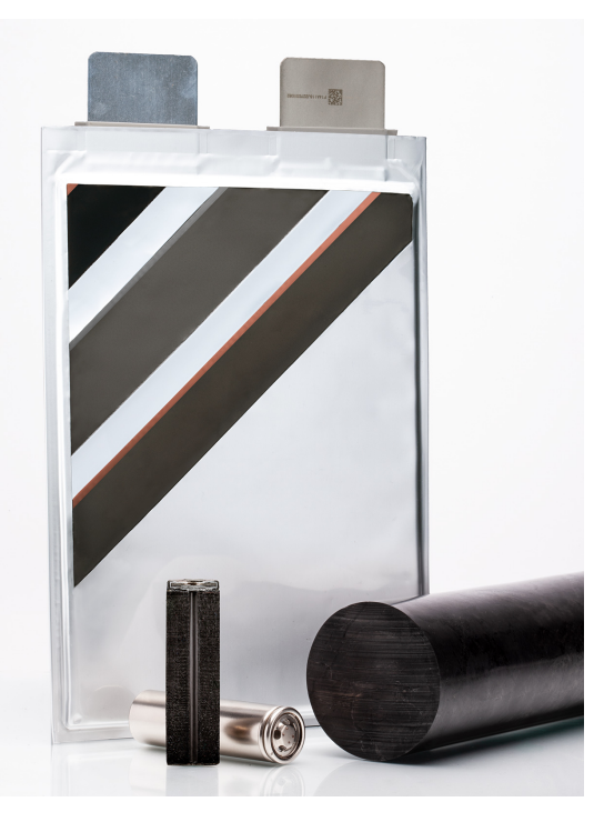
Figure 2. Vittangi graphite ore together with battery pouch cell and cylindrical battery cut to expose the graphite anode.

Nunasvaara drilling to date has comprised historic diamond core size WL56, 39mm core diameter completed by LKAB in 1982 and diamond core size WL66, 50.5mm core diameter completed by Talga in 2012, 2014 and 2016. Core recoveries were considered excellent.