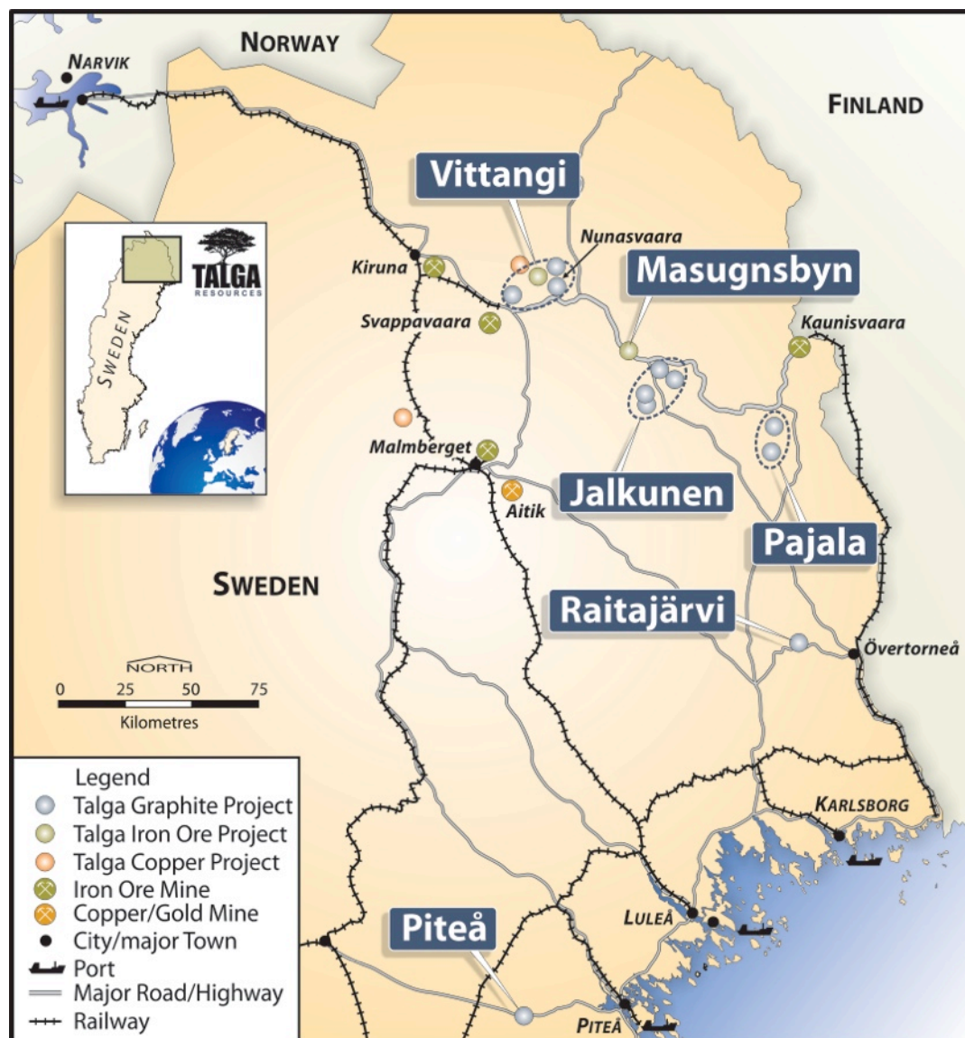
Fig 1. Talga Resources project locations in north Sweden.

Cannings Purple +61 (08) 6314 6300 whazeldine@canningspurple.com.au