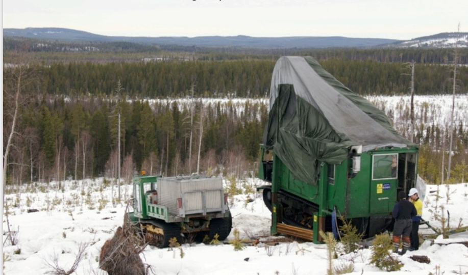
Photo 1. Completing final drillhole of the program at Raitajärvi, located just 2km from the Överkallix - Övertorneå Highway in north Sweden.

All drill samples have been transported to the laboratory and assay results from the first 10 holes are expected to arrive over the next two to three weeks.