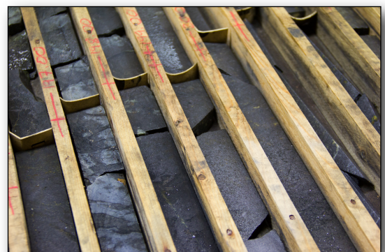
Photograph of a portion of drill core archived from the Junosuando iron deposit, viewed at the Swedish Geological Survey facility in Malå, Sweden February 2012.

An initial program of confirmation and infill drilling is planned to upgrade the JORC Code status of the iron deposit at Junosuando plus enable the collection of samples for metallurgical testwork. The results will be used to assess the project's economic potential as a modest tonnage - high grade mining operation with minimal capital expenditure requirements. The Masugnybsyn project is bisected by major highways and grid power, and is located approximately 60km from the Sapavaara railhead.