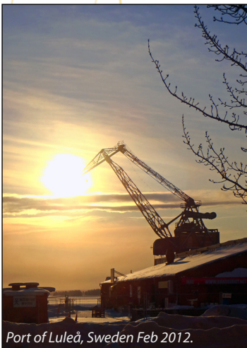
Port of Luleå, Sweden Feb 2012.