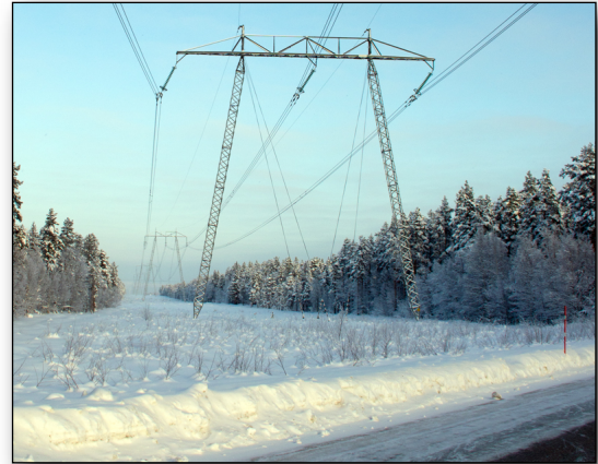
Photograph of grid power infrastructure established in northern Sweden. Talga photograph - Feb 2012

Within the majority of the TCL exploration permits favourable IOCG style targeting features include: geophysical signatures, surface Cu/Au mineralisation and anomalous historic drilling results have been recognised. The Kiskamavaara prospect located within the Kiskama project represents the most advanced and well documented example of this deposit style with disseminated and breccia hosted iron-oxide Cu±Co±Au mineralisation associated with potassium feldspar, biotite and scapolite alteration being reported over a >1km long mineralised zone (3) . Compilation of all outstanding data and evaluation targeting of the IOCG potential of all exploration permits will be undertaken in parallel with iron and graphite focused exploration programs during the forthcoming year.