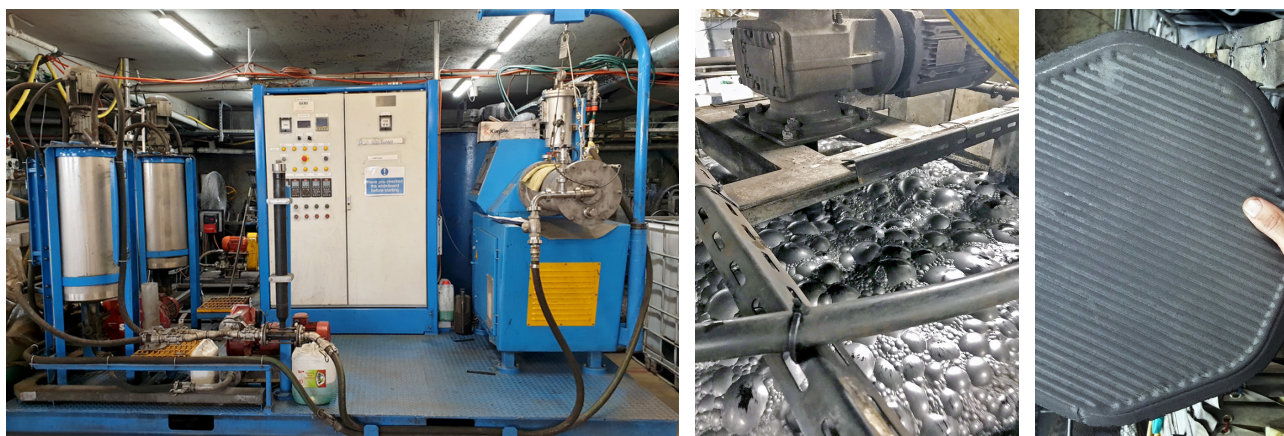
Figure 1 Vittangi project graphite undergoing pilot scale metallurgical testing

Further, testing conducted by technical partners in Asia has confirmed the potential to produce a coated version of Talnode-C that is suitable for sale as a fully engineered final anode material to maximise end-product value.