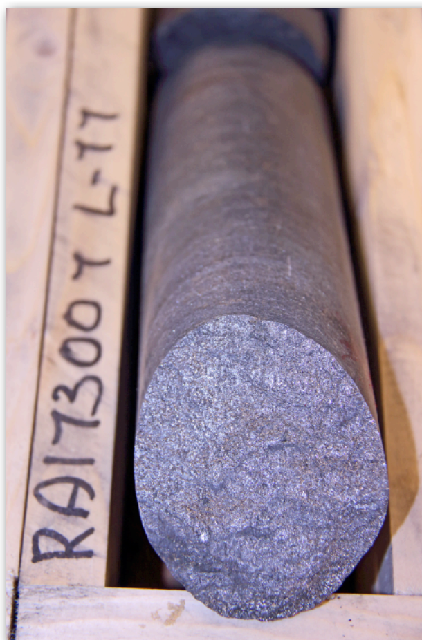
Photo 1. Graphite flake visible in first Talga drillhole at Raitajärvi.

The drilling program (for details see ASX:TLG release 4 th Feb 2013) is being undertaken to test for strike and depth extensions of the current JORC inferred flake graphite resource grading 10.8% Cg, which was based on historic drilling by the Geological Survey of Sweden. In addition, the drillcore will provide detailed geological, structural and metallurgical information to potentially fast-track the deposit to preliminary economic studies.