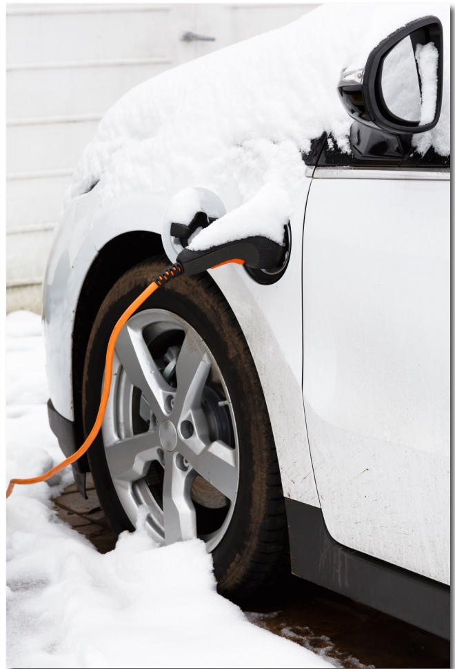
Figure 2 Electric vehicle range is negatively impacted by low temperature.

Talga Resources Ltd is an advanced materials technology company enabling stronger, lighter and more functional graphene and graphite enhanced products for the multi-billion dollar global battery, coatings, construction and composites markets. Talga has significant advantages in graphene production owing to its vertically integrated high grade Swedish graphite deposits and in-house process to product technology. Company website: www.talgaresources.com