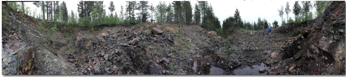
Fig 2. Panorama view of historic graphite pits at site of proposed test mining program, Nunasvaara graphite deposit.

Concurrently, Talga has commenced permitting for a test mining program to extract a bulk ore sample from Nunasvaara in the site of historic test pits (see Fig 2) and test dual graphite/graphene production through a nearby pilot plant to be constructed and commissioned by Talga. The focus of the test program will be to assess larger scale novel extraction techniques, processing methodology and provide significant size samples of graphite and graphene for economic evaluations. Subject to permitting approvals , Talga aims to commence this test work onsite in Q3 2015. The Company has recruited a new Permitting and Development Manager, and Group Geologist and has appointed the Swedish arm of global consultancy, Golder Associates, to complete key components of the sample program.