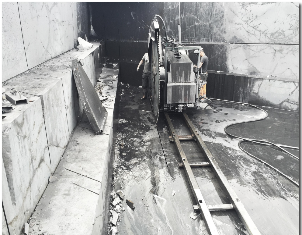
Figure 1 - Trial mining underway at Talga's Vittangi project using a rotary saw to cut graphite ore into block forms for extraction. Note the homogeneity of the mineralised zone.

Perth-based technology materials company, Talga Resources Ltd ("Talga") (ASX: TLG), is pleased to confirm that its trial mining program at the Company's wholly-owned Vittangi graphite project in Sweden ("Vittangi") has officially commenced. All site preparatory work has been concluded and the first graphite ore blocks have been successfully extracted and delivered to the Rudolstadt processing and storage facility in Germany.