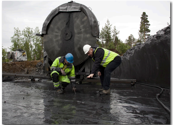
Figure 3 - Closer view of graphite ore showing amenability of mining method in precisely preparing the ore blocks and the homogenous nature of Vittangi graphite mineralisation.