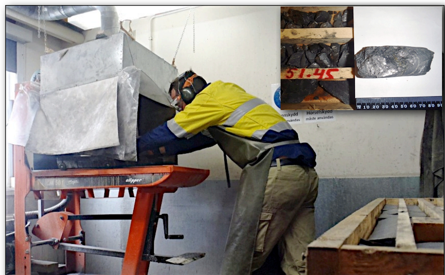
Figure 1. Processing of historic drill core underway at Swedish Geological Survey core archive facility, Malå, Sweden. Inset of graphite mineralised drill core being logged.