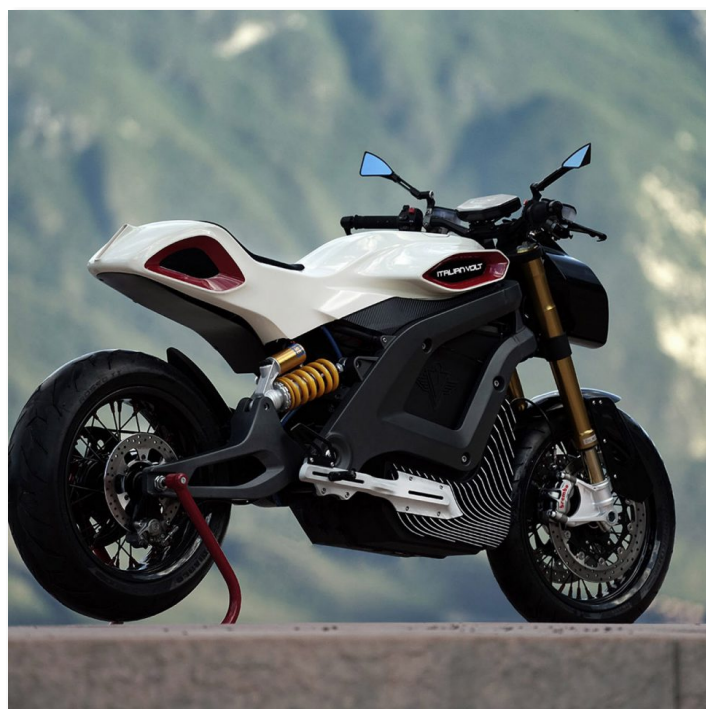
Figure 1 The Lacama, developed by IV Electrics