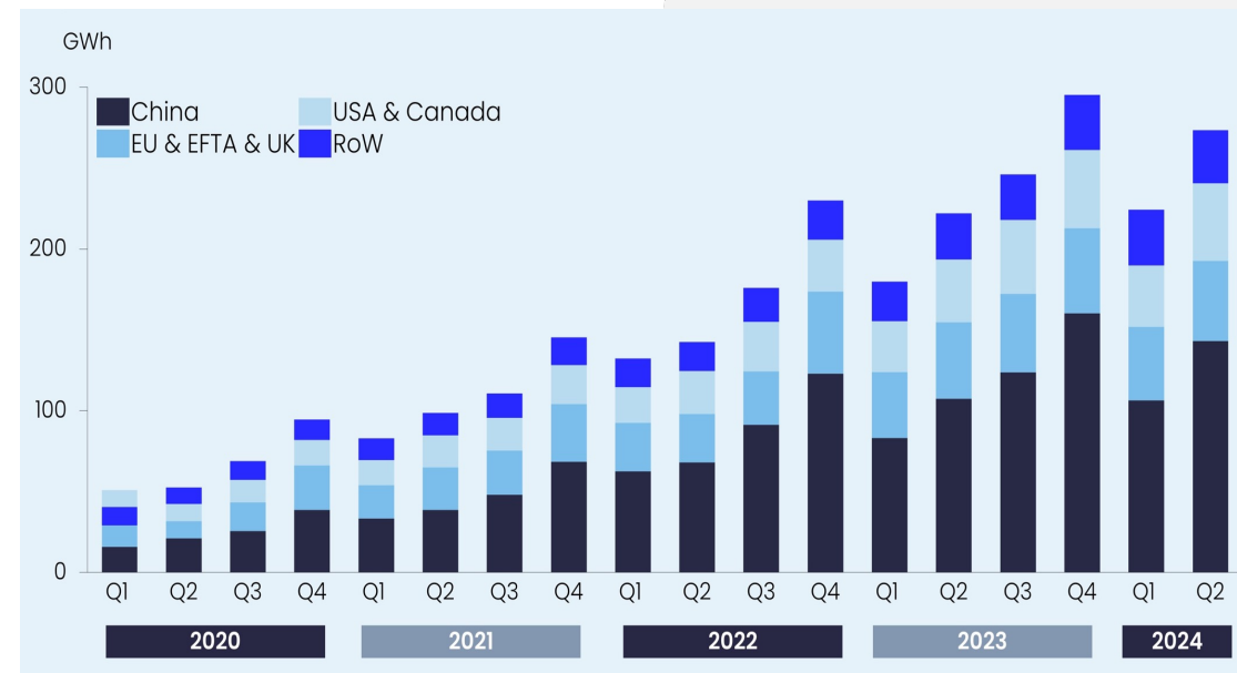
Rho Motion Quarterly Li-ion Battery Demand by Region - all end use markets (EV, ESS, 3C)

EV, ESS and 3C market Li-ion battery anode demand continues rapid growth compared to legacy material markets