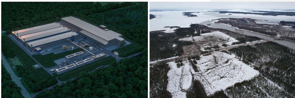
Figure 1 Artist render of Talga's anode refinery (L); land cleared at Luleå Industrial Park (R).