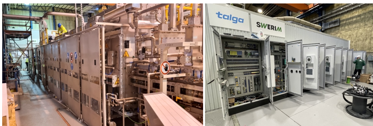
Figure 1 Part of Talga's Electric Vehicle Anode plant in Sweden; coating kiln (L) and electrical controls (R).

The wholly owned EVA plant will produce large scale commercial samples of Talga's flagship lithium-ion (Li-ion) battery anode material, Talnode ® -C, for qualification by the Company's automotive battery customers. All battery customers require assurance of product consistency and continuity of supply, however automotive customers have exceptionally rigorous quality approval processes that require semi-production process level materials to finalise purchase agreements.