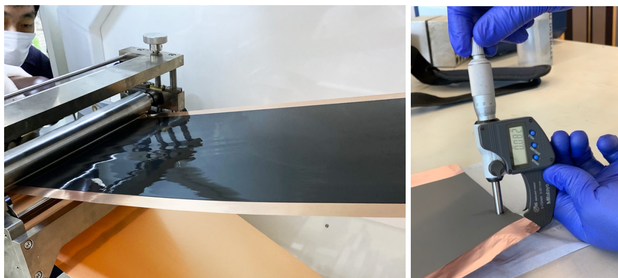
Figure 4 Talnode being used in Li-ion battery cell trials for global performance automotive customer.

While battery customers are expected to underpin development of Talga’s Swedish business in the near term, the opportunity for the Company to produce a broader range of graphene and graphite products from its integrated mine-to-product development remains part of its expansion planning considerations.