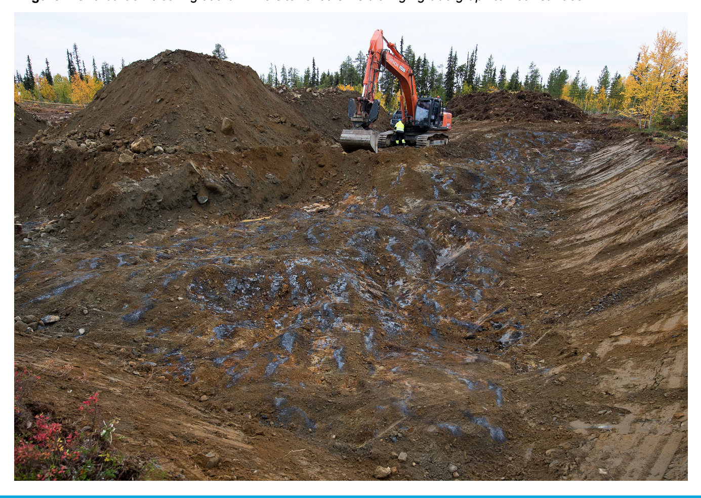
Figure 1 Overburden clearing at trial mine site reveals visible high grade graphite near surface.

Site works include the installation of environmental monitoring systems, such as dust sampling and water treatment equipment, and fencing as well as roadworks and overburden removal with stockpiling of topsoil for rehabilitation of the 100m x 100m site at the end of the 2021 Campaign.