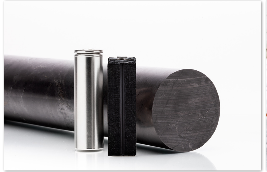
Figure 1 Talga's Vittangi graphite ore is refined into the world's lowest emission lithium-ion battery anodes suitable for electric vehicles and other battery applications to help decarbonise the global economy.

Trial mine operations are scheduled to begin in mid-September and in this first phase of the campaign, approximately 2,500 tonnes of graphite ore is planned to be extracted before the site is rehabilitated for the northern hemisphere winter. Rehabilitation will use the successful measures previously used in the Company's 2015-2016 trial mining campaign at its nearby Nunasvaara South deposit. The balance of the permitted 25,000 tonnes graphite ore is planned to be accessed in 2022.